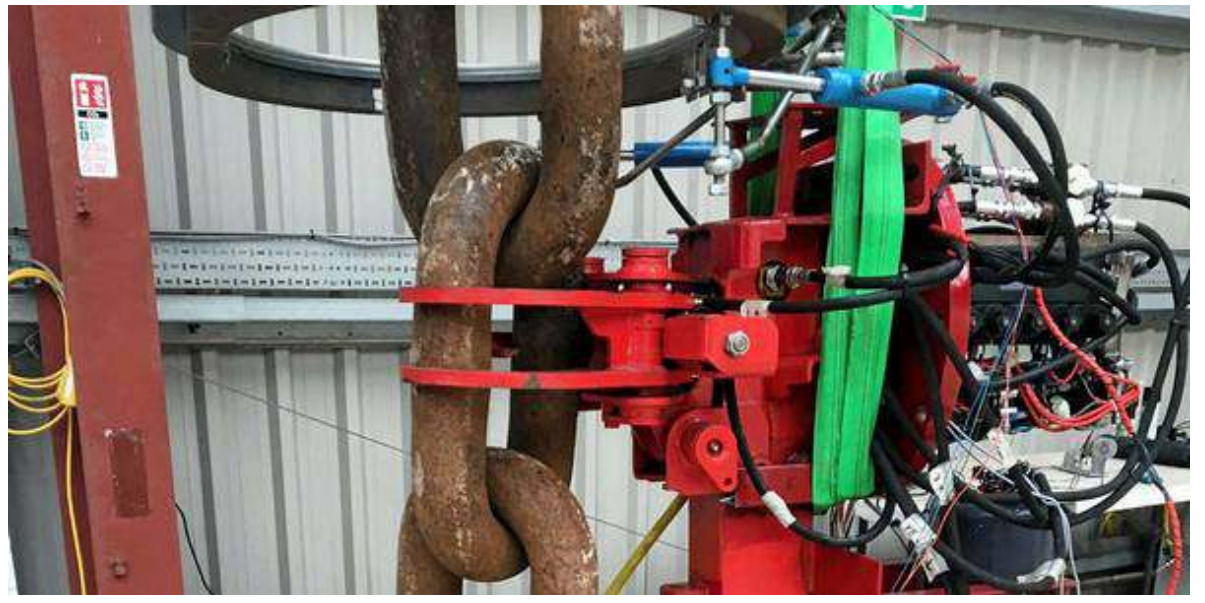
Grip: inspired, by the forestry sector, the 'LORIS' is used for inspecting mooring chains