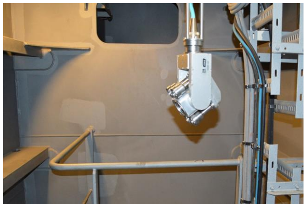
Typical camera system deployed in a confined space

Far-fetched?.....Not at all - during recent cargo oil tank inspections on an FPSO in the North Sea using NoMan remote camera systems the work was completed in four man days to the satisfaction of the client and the class society. The client estimated that it would have taken over 100 mandays to have achieved the same result using traditional methods with higher risk, cost, POB and out of service time.