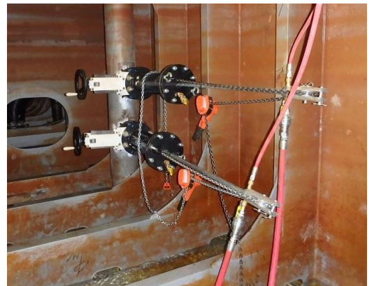
Bladder repair using ODIN inspection tool

This has been proven on many occasions, including the recent completion of a class approved underwater hull and twenty one sea valve inspections, with three sea valves repaired on a drillship offshore Angola, whilst the vessel was on station and in operation, saving 10 days off-hire time.