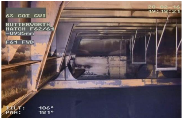
Remote optical inspection of cargo oil tank

Robotic methods work well in combination with data digitisation, but require quite significant changes in many aspects of how we do business. If we compare current and future methods of inspecting a cargo oil tank we would see more onshore engineering, and planning to pinpoint high risk areas and expected failure modes, derived from Big Data analysis.